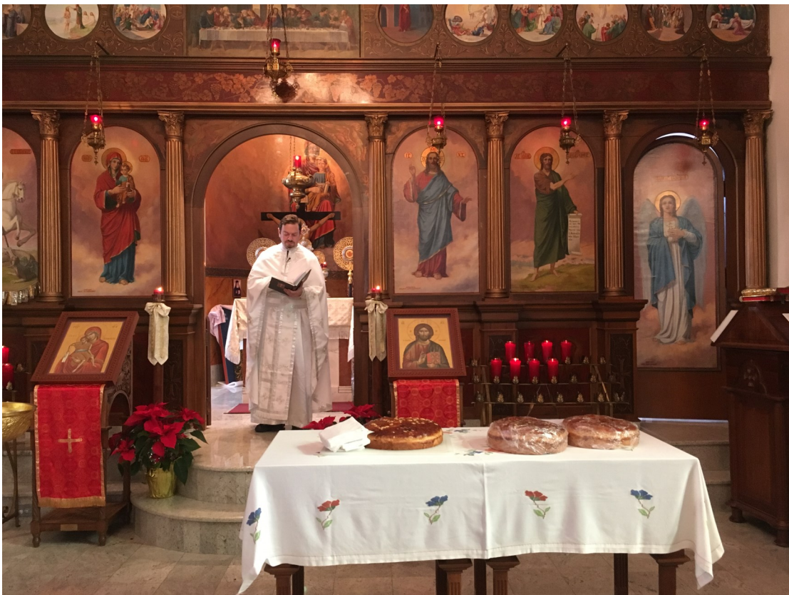
Vasilopita Celebration 2017