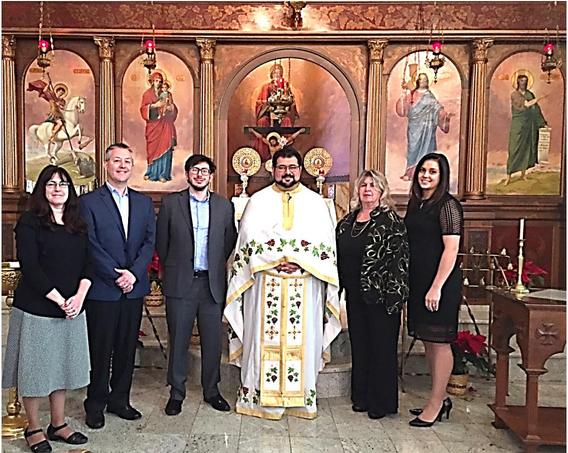
Our 2020 Parish Council was affirmed on Sunday, January 12, 2020.

"I, do solemnly affirm that I will uphold the dogmas, teachings, traditions, holy canons, discipline, worship and moral principles of the Greek Orthodox Church, as well as the Charter and Regulations of the Greek Orthodox Archdiocese of America, and that I will fulfill faithfully and sincerely the duties and obligations required of a member of the Parish Council. So help me God."