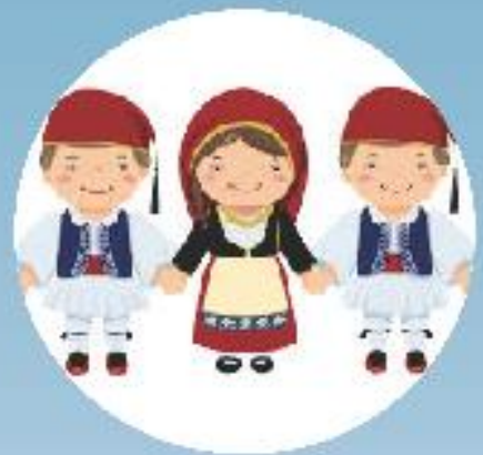
Traditional Greek dance (in-person only)