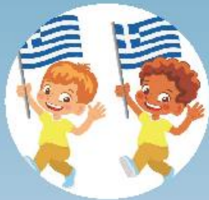
Greek culture and traditions