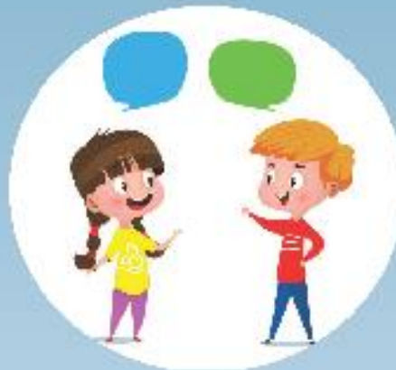
Basic conversational skills, modern Greek reading and writing